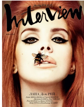
Lana Del Rey, Interview Magazine